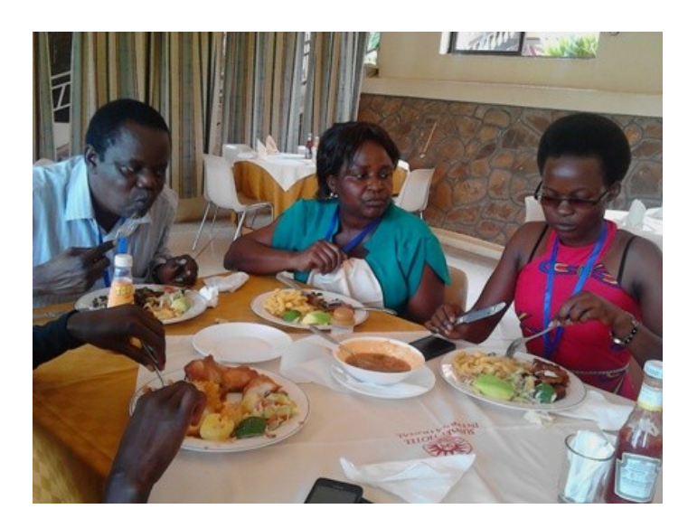
Facilitators having lunch