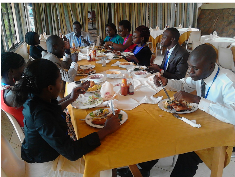
The participants having Lunch